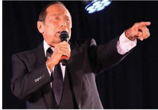
Paul Anka entertained nearly two hours at the 1964 Class Reunion

His nearly two hour performance left an indelible memory in the hearts of all. While reunions are created to renew friendships and relive fond memories of high school years, Anka's performance not only rekindled high school memories but also created an atmosphere that will be remembered by all and shared with many others for decades to come. Anka signed autographs and posed for pictures following his performance.