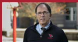
Thomas Maj Cardinal Mooney President